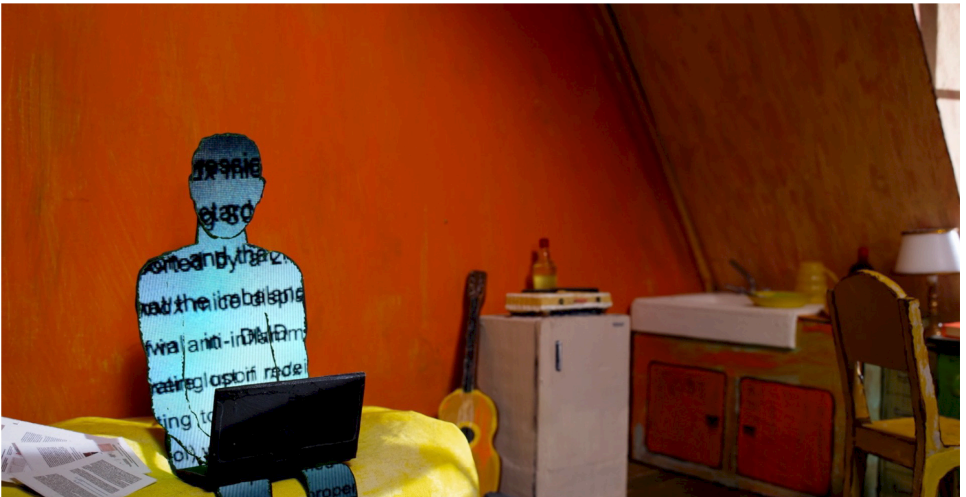
Extract from the movie

This film combines several animation techniques: revolving scenery, live drawing, manipulation in an aquarium, cartoon and stop-motion animation of characters. Adapting to the needs of the narrative, it switches from black and white to colour, from ink to poster paint, from shadow play to cartoon. This non-dialogue film lasts about eight minutes and is suitable for all audiences. Our aim is to propose it to different animation and short film festivals, TV channels or online platforms.