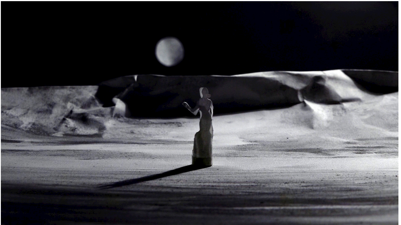
Extract from the show

The public is plunged into the intimacy of the creative process, free to watch the production of pictures on the drawing board or the cinematic dimension of their projection on the screen. The last eight minutes of the show are devoted to screening the animated film developed through this research. As they watch the film, the audience realises the choices that were made: the ideas, characters and paintings that were kept, and those that were not. An intimate relationship develops between the audience and the film because they know its journey, from the first stroke of the pen, the first stroke of the eraser through to the end credits.