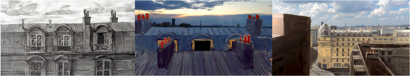
Research drawing and paintings

An exhibition is also proposed to follow on from the short film and the show. Through sketches, preparatory drawings and scenery, etc. the audience takes a peak behind the scenes of these two creations while learning the techniques and processes used in animation. Some installations can be handled directly by the audience to create an animated picture. The exhibition can be held in theatres if there is enough space or in other venues such as a museum, exhibition hall or other unusual settings.